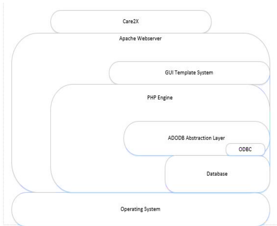
Figure 3: Care2x Architecture